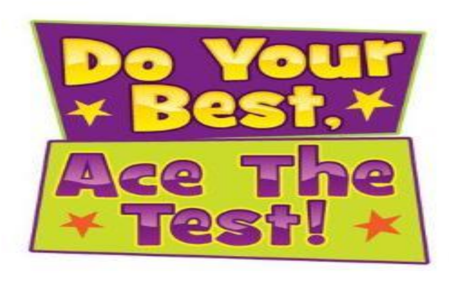
Revised B. Dechman 6/9/21